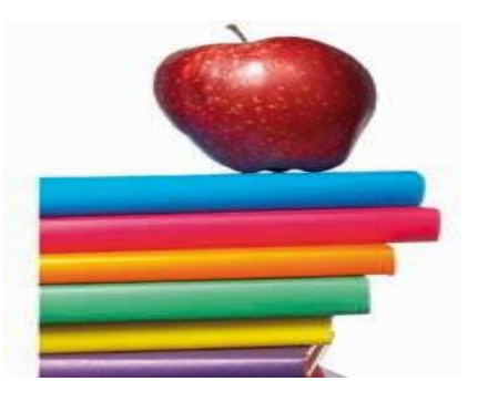
Corporate & ICT